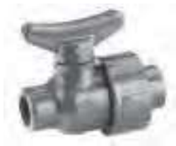
Laboratory ball cock type 322 PVC-U With solvent cement sockets metric